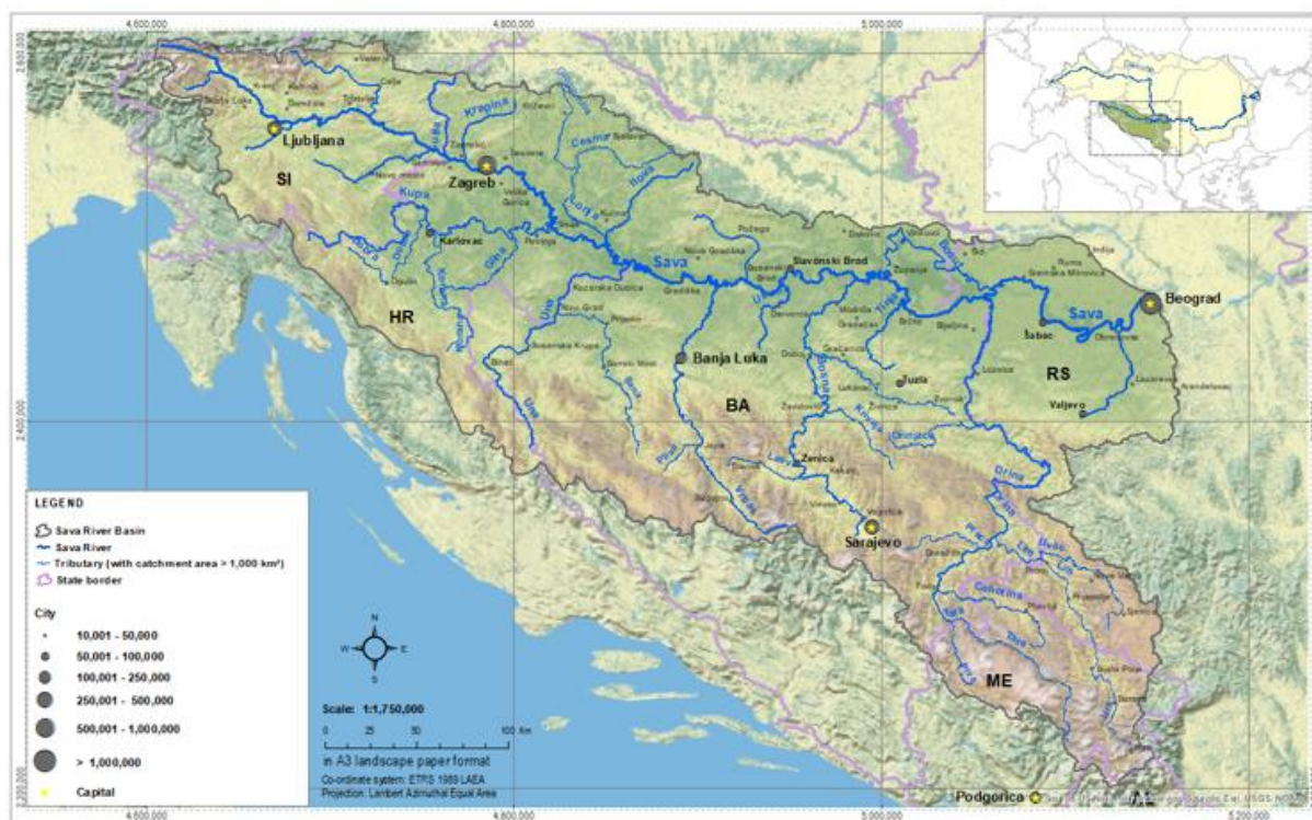
Figure 1. Location of the Sava River Basin

The Sava River Basin covers an area of approximately 97,200 km 2 . Encompassing substantial portions of Bosnia and Herzegovina, Croatia, Montenegro, Serbia, and Slovenia, the Sava River Basin constitutes 12% of the Danube River Basin area, making it the second-largest sub-basin of the Danube (Figure 1).